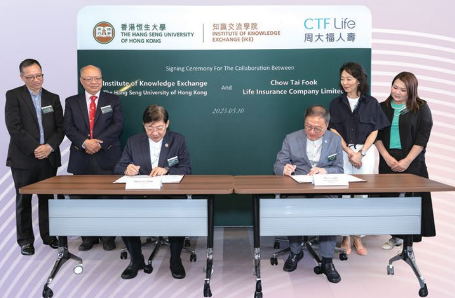
IKE signs MoU with CTF Life to offer consultancy and training services to family offices and related practitioners in GBA. 知識交流學院與周大福人壽簽署合作備忘錄，啟動雙方在大灣區內共同為家族辦公室和相關從業人員提供諮詢和培訓服務。

恒生大學的知識交流學院與周大福人壽合作，向大灣區內的家族辦公室及相關業界人士提供諮詢及培訓服務，加強跨境專業網絡，並推動香港作為全球教育及創新樞紐的願景。知識交流學院同時與大灣區醫療專業發展協會合作，開設專為醫護而設的培訓課程，在大灣區應用嶄新科技。