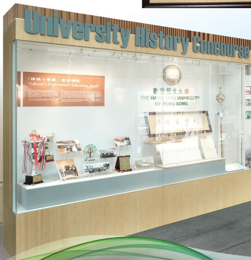
The University History Concourse 大學校史廊