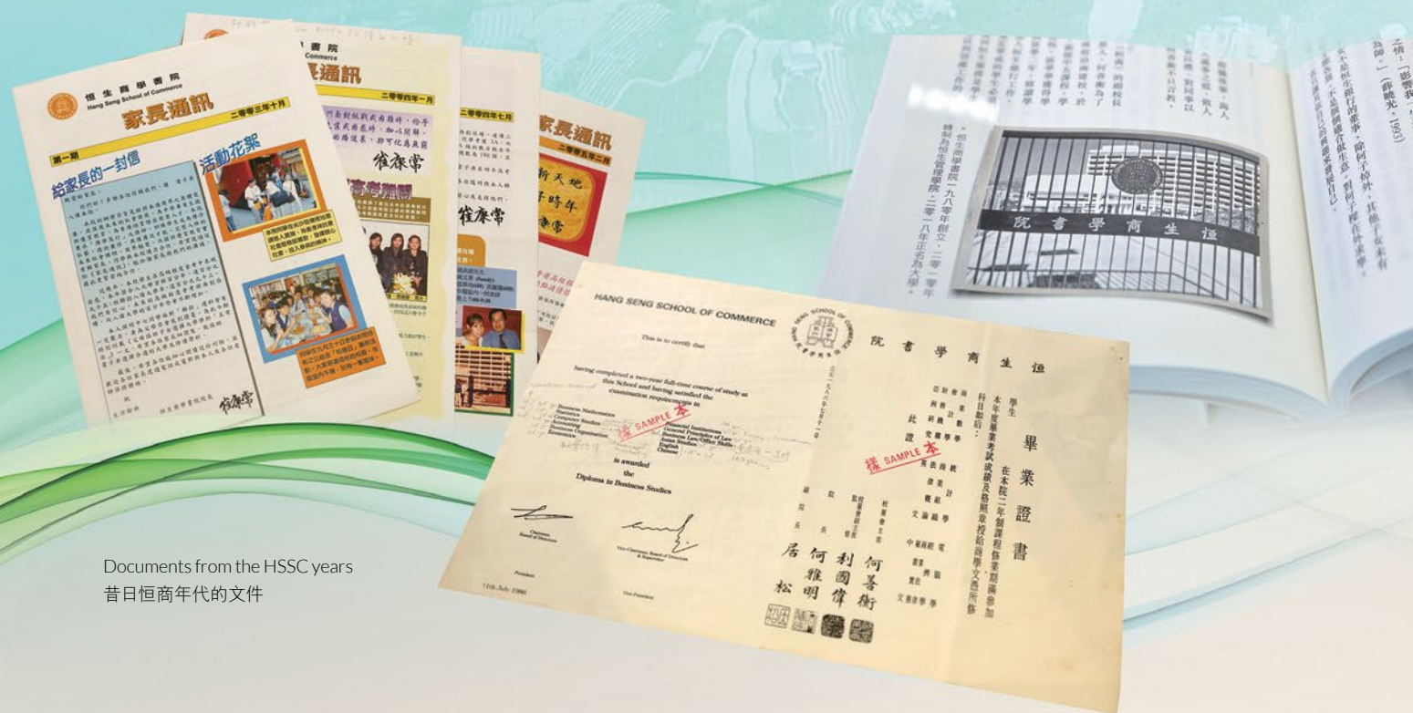
Documents from the HSSC years 昔日恒商年代的文件

所謂「檔案」，意指文件、歷史紀錄。恒生大學開校45年來，產生無數教學、行政文件和學術文章等。為籌備建立「大學校史廊」，大學檔案及特藏組需蒐集建校以來的歷史文物作展覽。然而早期恒商年代的文獻沒有有系統地保存，散落在不同持份者手上，在校方努力和有心人捐贈下，一些昔日文獻例如恒商課程表、入學申請表、舊相片、政府信函等得以展出，重現公眾眼前。