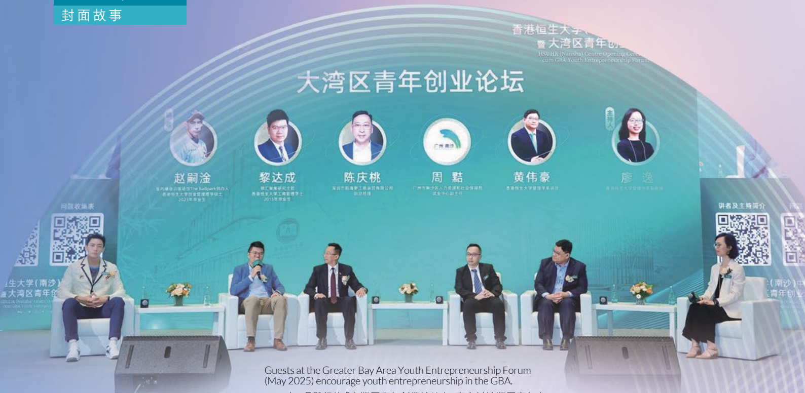
Guests at the Greater Bay Area Youth Entrepreneurship Forum (May 2025) encourage youth entrepreneurship in the GBA.

2025年5月舉行的「大灣區青年創業論壇」，嘉賓討論灣區青年在大灣區創業的優勢與挑戰。