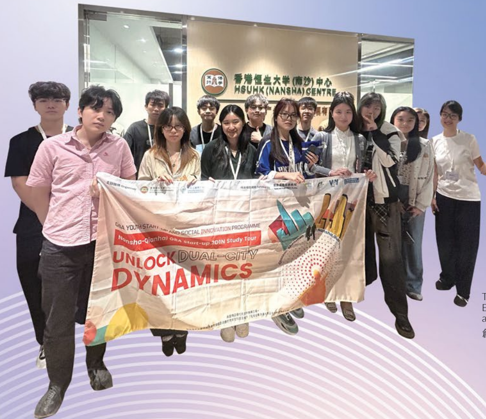
The Centre for Innovation and Entrepreneurship hosts student activity at HSUHK (Nansha) Centre. 創新及創業中心於香港恒生大學(南沙)中心舉辦學生活動。